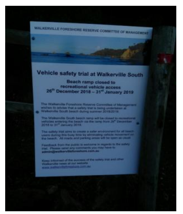
What benefits is expected to flow from any such Trial?

Has this trial been discussed / approved with DELWP, Shire and the Boat Club.?